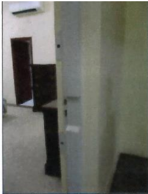
2x4 reinforced door frame, & horizontal cane bolt sleeves 1-Metha bedroom Safe Room