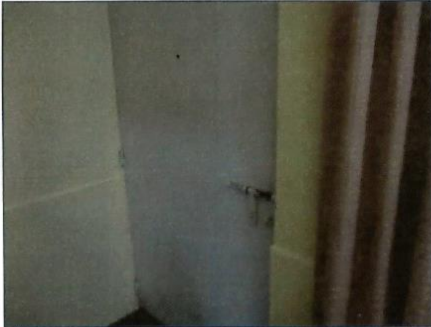
OBO-designed 15-Minute FEBR equivalent metal door w/ horizontal cane bolt