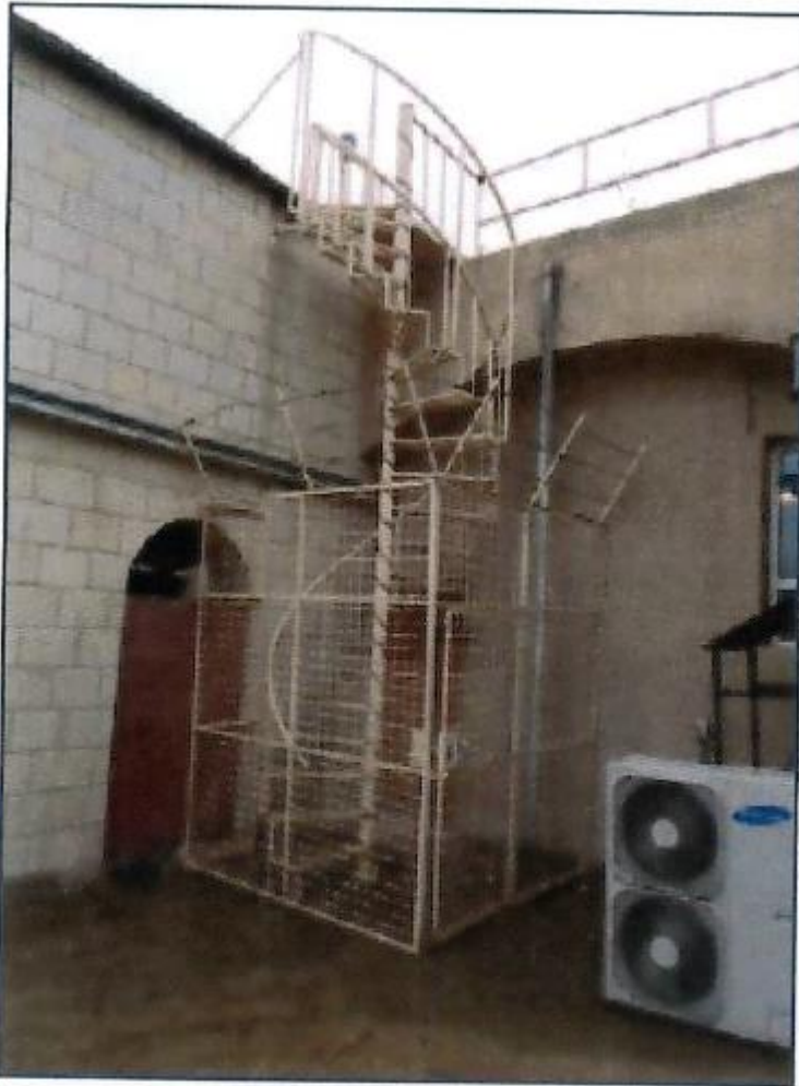
Example of enclosed emergency stairwell Denying access to latch is critical